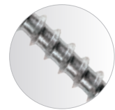
Option of 305 or 316 Stainless Steel