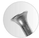
Bugle head for clean, flush, countersunk finish