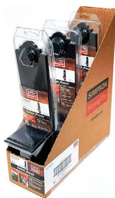
Outer / Carton