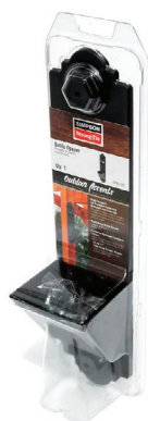
Inner / Pack