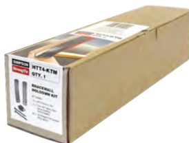
Inner / Pack