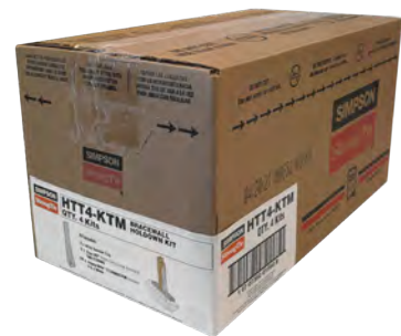
Outer / Carton