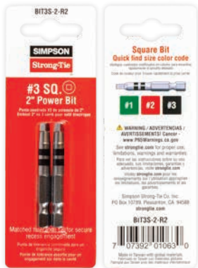
Square driver bit example