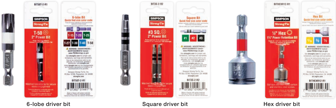
6-lobe driver bit

Each package has a quick-reference colour guide that helps you determine which colour driver bit fits your fastener