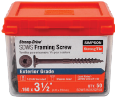
SDWS16312QR50 89mm (3 1/2") Qty 50