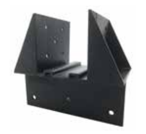
Double Triple Connector