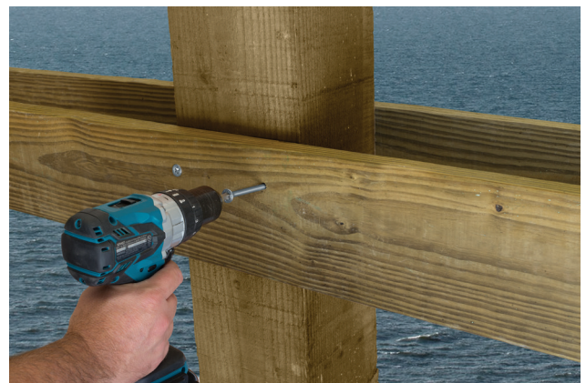
An ideal replacement for Coach Screws

Simpson Strong-Tie® Australia Pty Ltd Call 1300 STRONGTIE (1300 787 664) www.strongtie.com.au