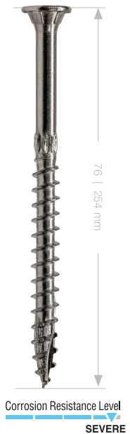
Table 1. Strong-Drive® SDWS Timber SS Screw Specifications