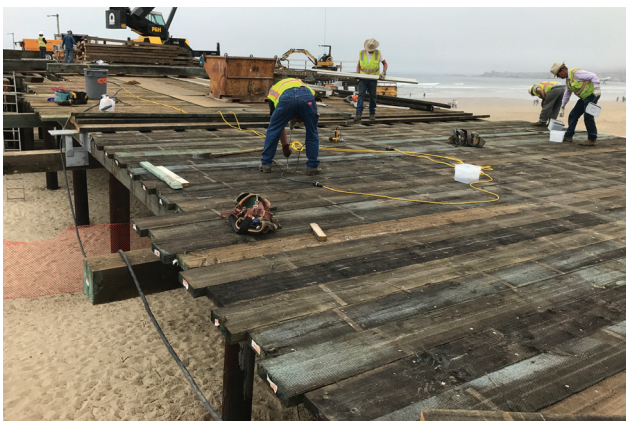
Docks, Pier's, Boardwalks, Jetty and Wharf construction